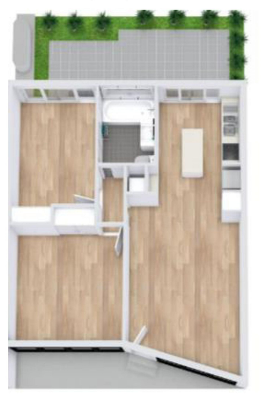
4 / 239 Esplanade ALTONA